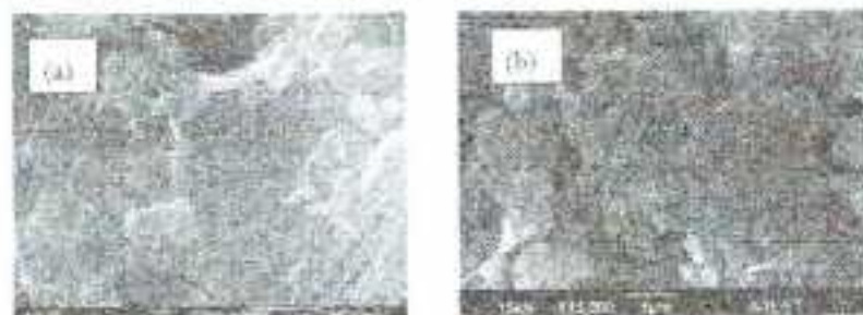
Figure 2. SEM images of (a) zeolite, and (b) acid activated zeolite

At subcritical condition, the water dissociates into H_3O^+ and OH^- ions, and the presence of these excess ions indicates that at subcritical condition the water can act as an acid or base catalyst. The subcritical hydrolysis of the water hyacinth and the conversion of the