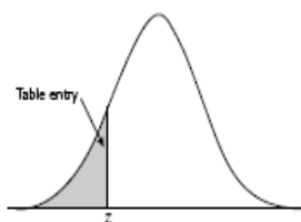
Table entry for z is the area under the standard normal curve to the left of z .